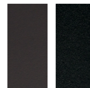
C11 Moka C09 Nero