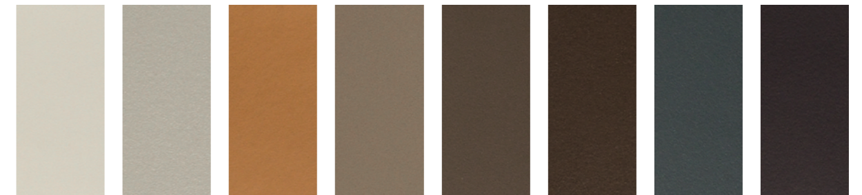
C23 Ghiaccio C01 Silver C39 Sella C29 Taupe C28 Fango C31 Tabacco C18 Grafite C32 Caffè