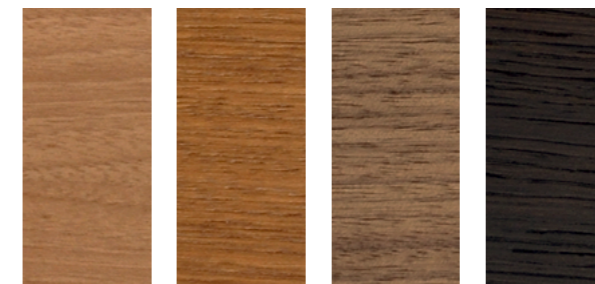
Noce Italiano Biondo Teak Gold Noce Canaletto Rovere thermo