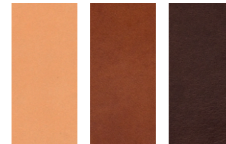
Naturale Cuio Foresta