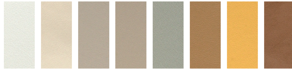
117 Neve 198 Ostrica 199 Canapa 179 Lino 159 Creta 174 Siena 208 Zabaione 131 Cuoio