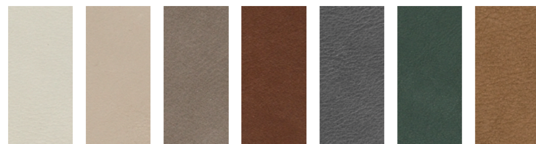
2 Mediterraneo 3 Mediterraneo 23 Mediterraneo 22 Mediterraneo 9 Mediterraneo 11 Mediterraneo 8008 Mediterraneo

Dimensions in centrimetres. The company has the right to modify the models without prior notice. The information given here are based on the latest product information available at the time of printing.